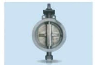
Teflon coated body with titanium disc